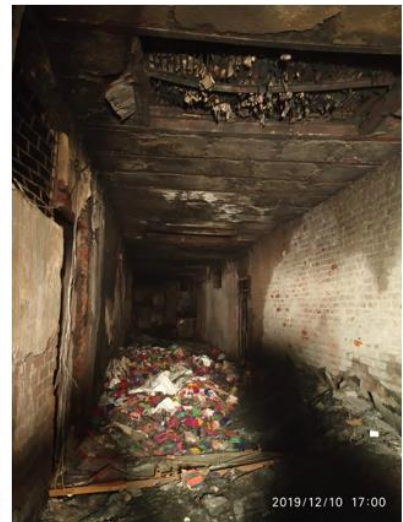
Anaj Mandi, Delhi.